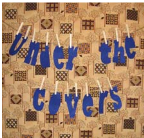
exhibit for the transition from our move back (because of new flooring)

We recently installed an exhibit of DesBrisay's nine quilts from the collection, full of color and warmth. Thinking that this would be an easy